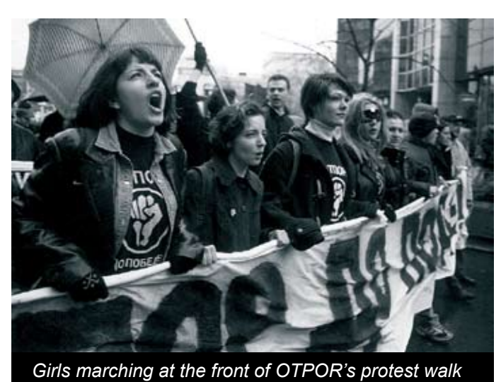
on November 11, 1999, at the beginning of General Zdanova Street, immediately before the police intervention

November 1999 – Otpor activists held the Otporiade, a rock concert in Students' Park in Belgrade, to mark the third anniversary of the massive students' protest of 1996/97.