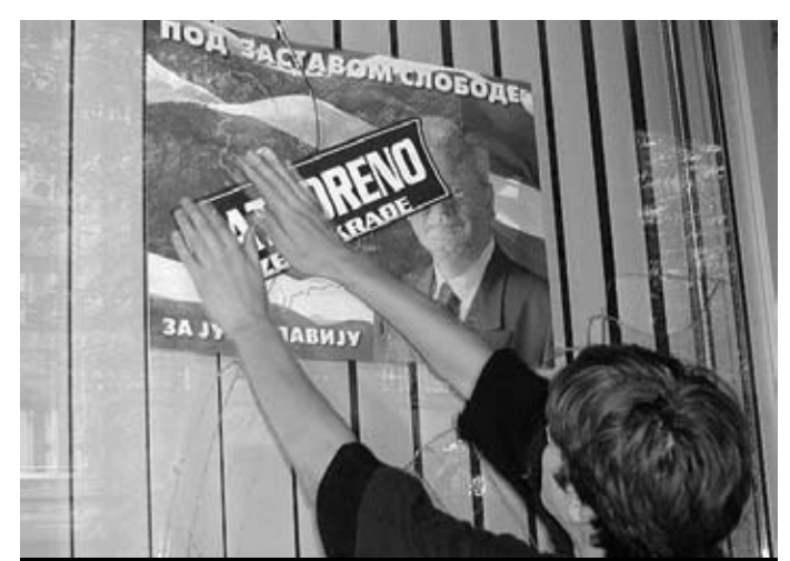
Every business that was closed as part of the universal strike in protest against ballot rigging was labeled with a "Closed due to theft" sticker by citizens.

September 24, 2000 – Milosevic lost the elections. Together with the opposition, Otpor invited the people to start a universal strike and thereby bring Belgrade and other Serbian towns and cities to a standstill. The campaign "Closed due to theft" started.